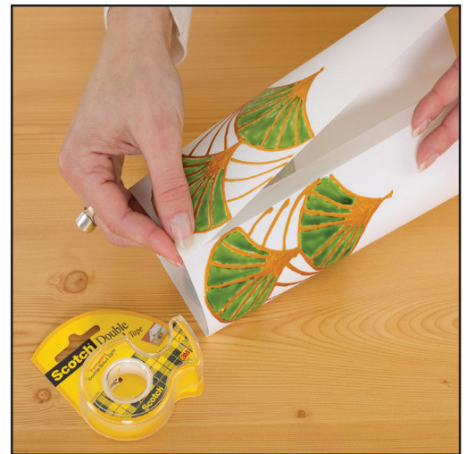
Step 2: Refold and tape.