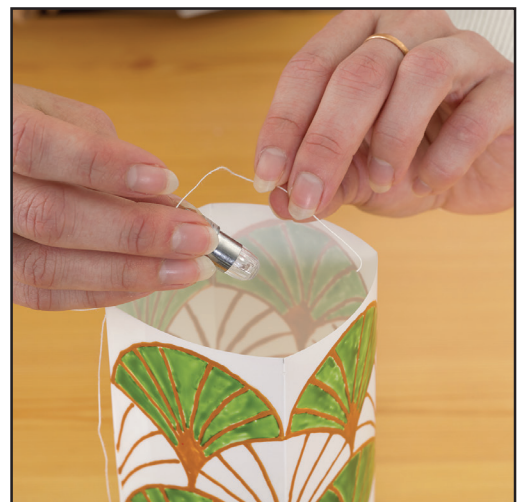
Step 3: Tie on balloon light and use extra string to hang lantern.