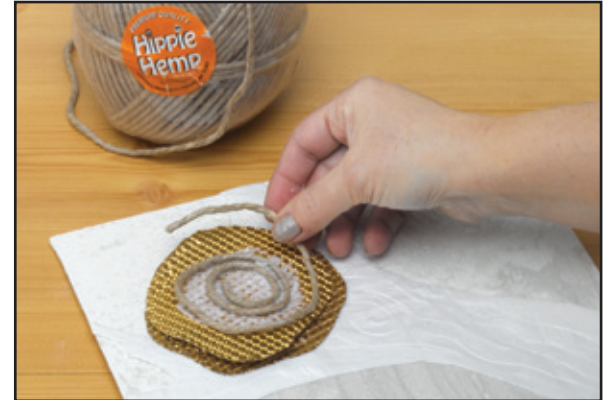
Step 2: Adhere textural components such as fabric, twine, crimped foil, or wire mesh to the canvas.