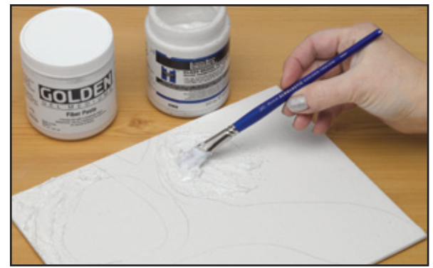
Step 1: After creating a composition on canvas panel, apply gel medium.