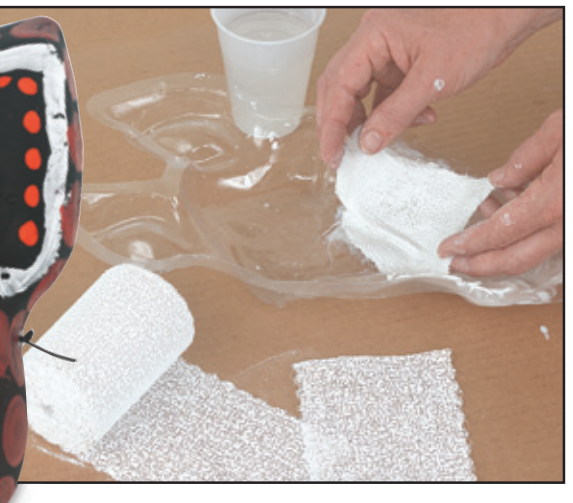
Step 1: Create a mask by pressing plaster cloth into an animal face mold. Allow to dry.