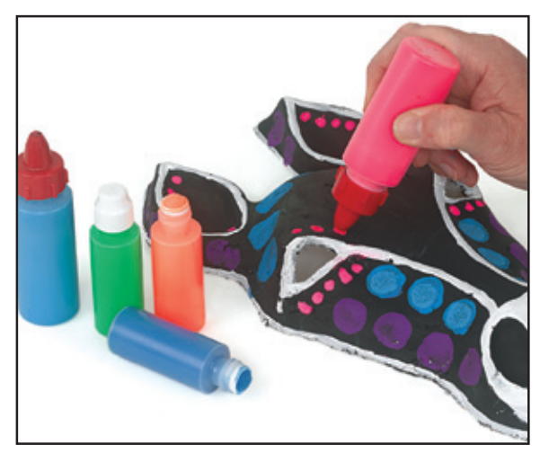
Step 2: Paint the mask black first, then decorate it with paint dots.