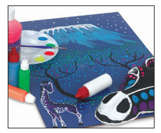
Step 3: Create an environment for the mask on a colored corrugated sheet using mostly paint dots.