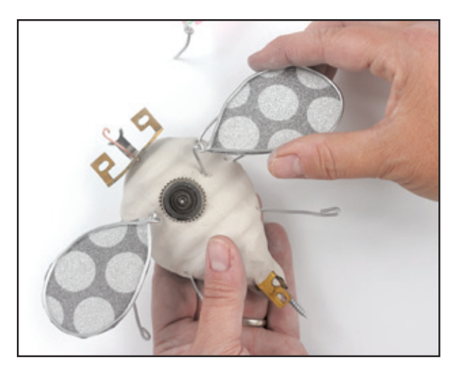
Step 3: After creating a body out of air-dry clay, push the various metal or wire parts into the clay to create a finished insect.