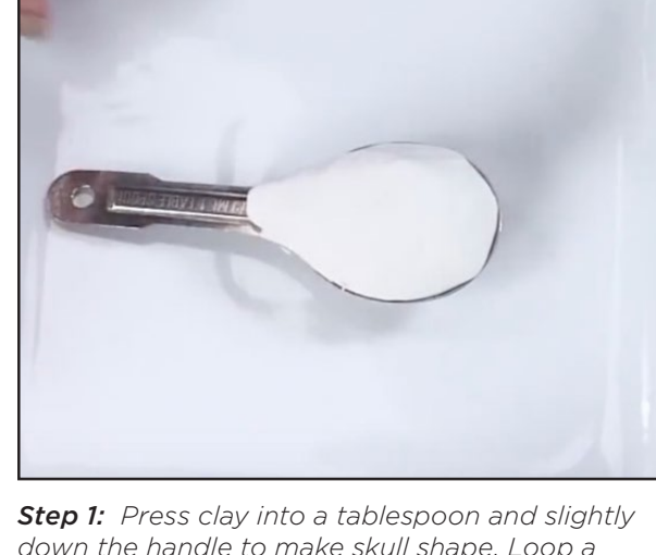
down the handle to make skull shape. Loop a piece of wire and press ends into the top of the skull.