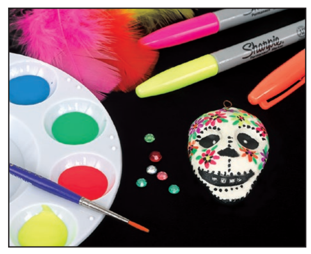
Step 3: Decorate with fluorescent markers, glow-in-the-dark paint, sequins, feathers, and more. Hang on a string or cord, turn out the lights and enjoy Dia de Muertos!