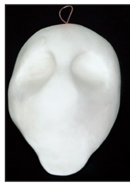
Step 2: Press into the clay with index fingers to form eye sockets.