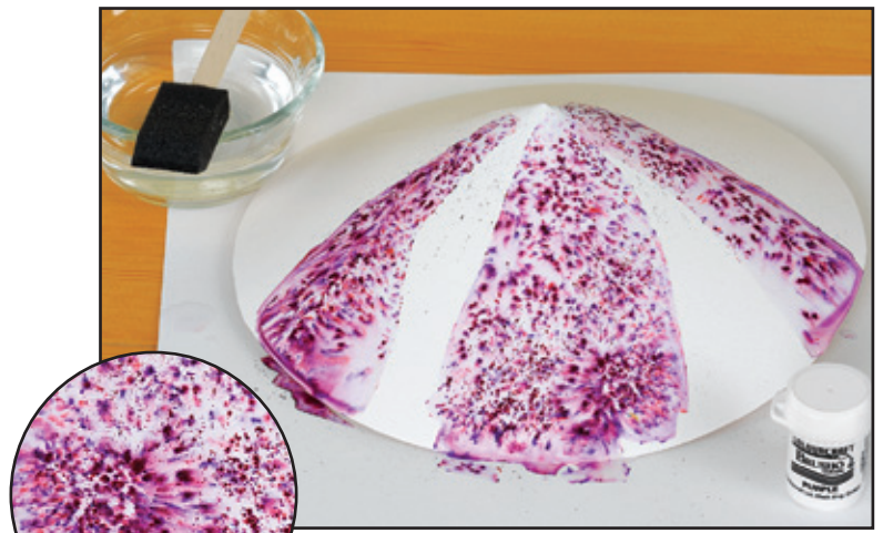
Step 2: Apply water to one section of the shade and sprinkle Brusho Crystals onto the wet paper.