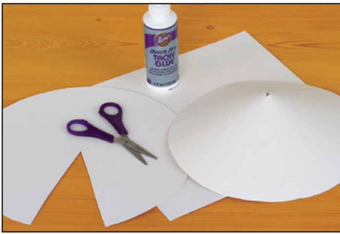
Step 1: Construct the parasol shade with watercolor paper.