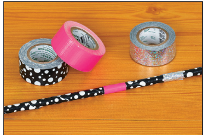
Step 3: Design the handle of the parasol with decorative tape.

The parasol may be placed in a jar to hold it while decorating.