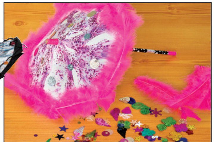
Step 4: Attach the handle with more tape, then finish the parasol by decorating with feathers, ribbons, sequins, etc.