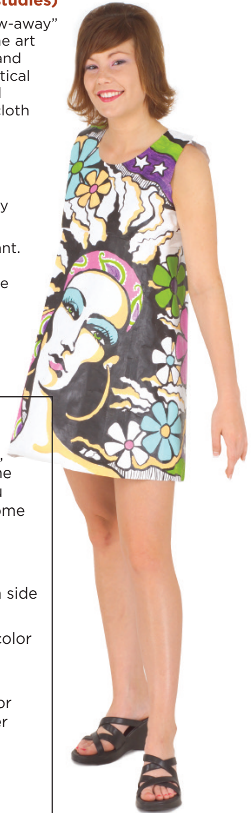
“Psychedelic dress” painted with Blick Artist’s Acrylic. See next page for pattern..