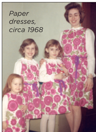
Paper dresses, circa 1968