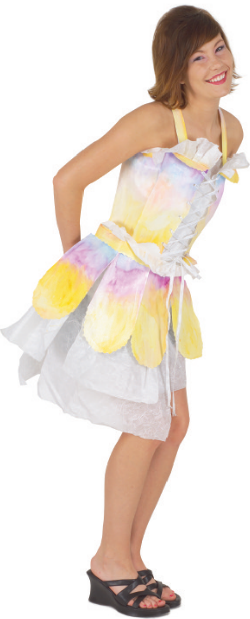
"Watercolor Dress" made with watercolor paper, Unryu paper, hook and loop fasteners, staples, ribbon and watercolors

Cut 2 pieces for each dress. Adjust sizes as needed for various ages and body sizes. Black squares show placement of hook and loop