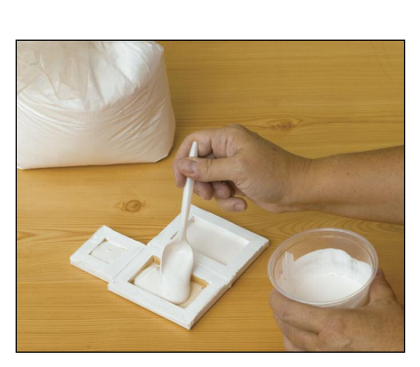
Step 3: Mix the plaster and fill the back of the canvases until they are half full.