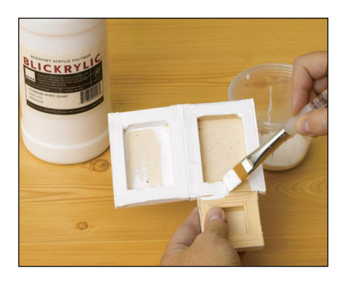
Step 2: Paint the canvases with acrylic color.