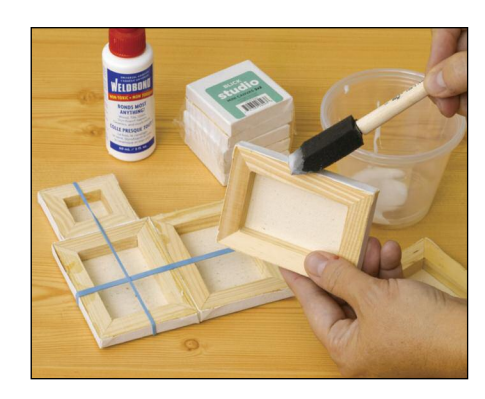
Step 1: Arrange a composition of miniature canvases and glue them together.