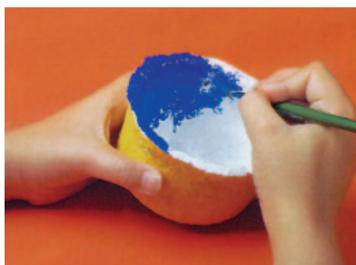
Step 4 and 5