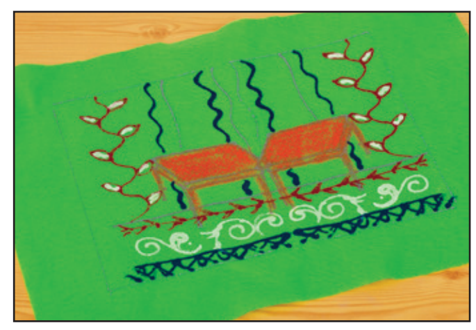
Step 3: Use paint in a Detail Writer to trail on lines and then add patterning. Fold the felt over, lining up the registration mark and press to transfer the paint trail. Repeat with as many colors and patterns as desired.