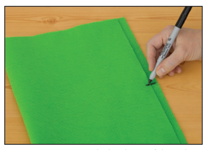
Step 1: Trace around a book onto felt, and cut out, leaving a 3" border all around. Fold the felt in half width-wise. Slightly offset the top half and draw a registration mark onto both edges of the felt as shown.