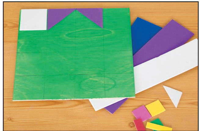
Step 2: Sketch a light 2" grid onto the panel in pencil.