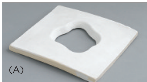
(A) A drop ring can be created from fired moist clay. Make a smooth, beveled edge for the glass to slip down through.

The drop ring hole may be round or irregularly shaped and should be slightly larger than the sheet of glass that is being dropped. The ring may be made out of any fired moist clay, however, more porous clay bodies such as Amaco® No. 27 White Sculpture Raku clay or Amaco® No. 38 White Stoneware clay withstand thermal shock well and are recommended. The drop ring may be used multiple times before deteriorating or cracking. When creating a drop ring, a smooth beveled hole is cut into the clay for the glass to drop down through, see (A) for an example. Size the hole so that at least 1/3 of the glass sheet is still supported by the ring on all sides. Apply a thin coat of Kiln Shelf Wash and fire Amaco® No. 27 or Amaco® No. 38 clay drop rings between cones 05-5.