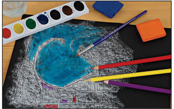
Step 4: Add color and details with colored pencils, tempera and watercolors.