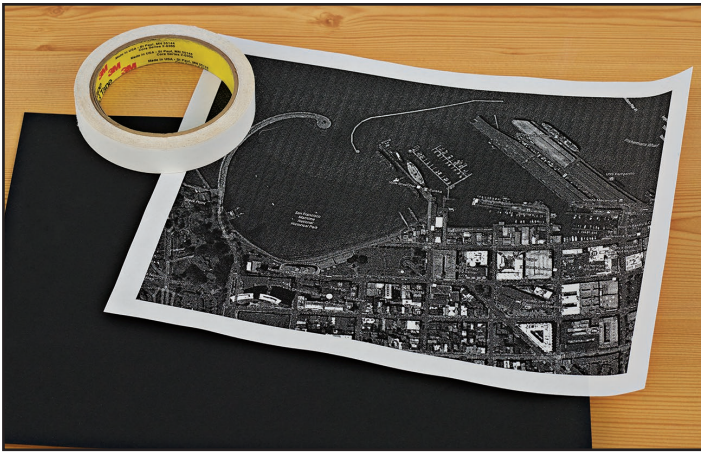
Step 1: Choose a view from a satellite image, print it, and tape it to a piece of black drawing paper.