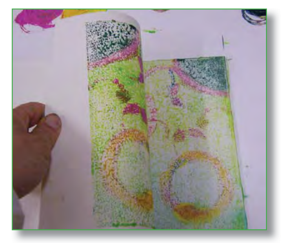
Pulling Ghost Print

Repeat Step 5 & 6 to make secondary impressions or ghost prints if needed. Depending on how much Thick Slow Medium and Interactive was used, multiple impressions can be achieved.