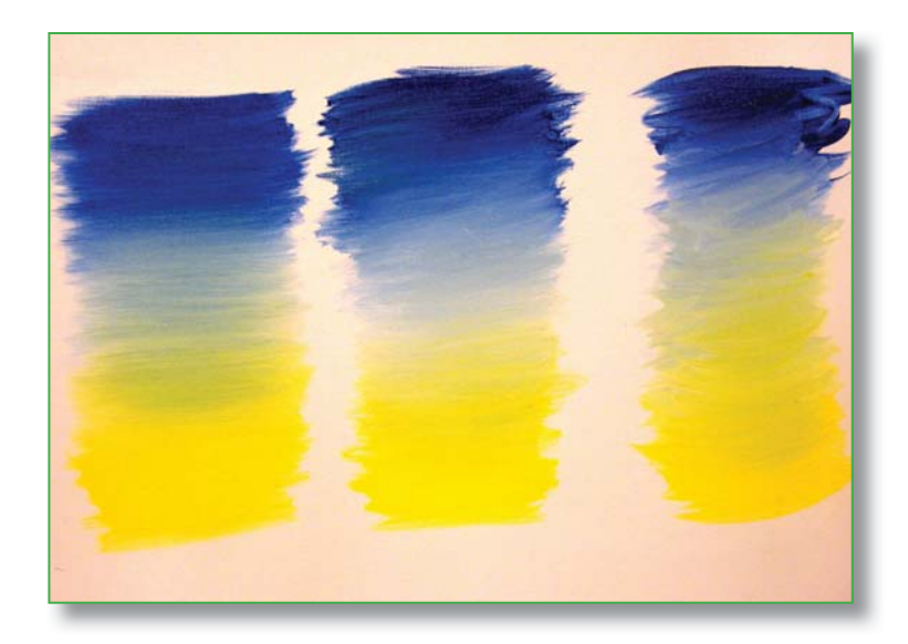
Painting Into The Couch

6. When dry, compare each swatch. Note how the medium affects the transparency and the texture of the paint. Compare also, this sample to the one you created in the 1st exploration. Consider what method - adding medium to the paint or painting into the couch - would work best for you.