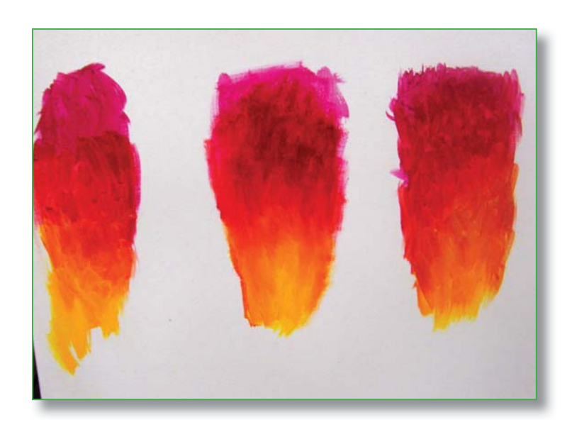
Painting Mediums Mixed With Interactive

Painting into a couch of Slow Medium is an excellent way to achieve smooth gradations of color without harsh edges.