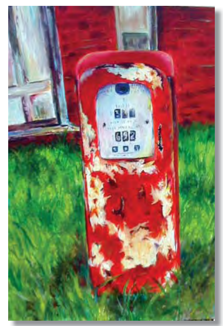
Gas Crisis, Jennifer VonStein

Clear Painting Medium is probably the easiest medium to use and understand. It essentially contributes more water to the paint, making it easier to create and spread a mid-viscosity paint. It helps retain water, useful when learning to use the Fine Mist Water Sprayer because it reduces the risk of runny paint due to overuse of the spray. It is also useful for glazing because transparent colors need to be diluted without becoming runny in order to create the right balance of transparency.