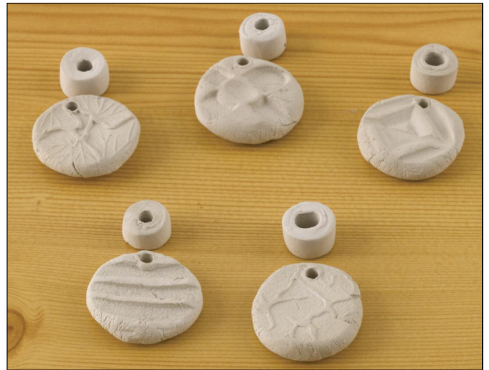
Step 2: Make a hole near the top of each disc. Form smaller balls of clay into a bead shape.