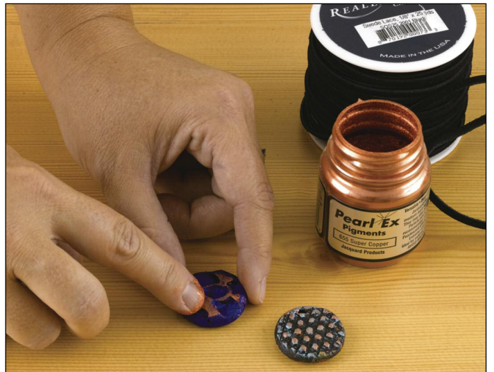
Step 3: Allow to the clay to dry and then embellish it with paint or Pearl-Ex pigments. String the pieces on a cord to create Sole Pendants!

K-4 Students use different media, techniques and processes to communicate ideas, experiences and stories.