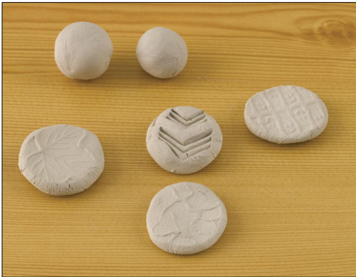
Step 1: Press clay balls onto the sole of a shoe to pick up the textures.