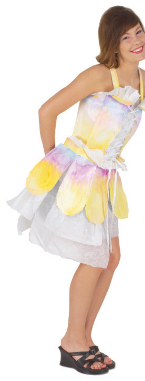
"Watercolor Dress" made with watercolor paper, Unryu paper, hook and loop fasteners, staples, ribbon and watercolors