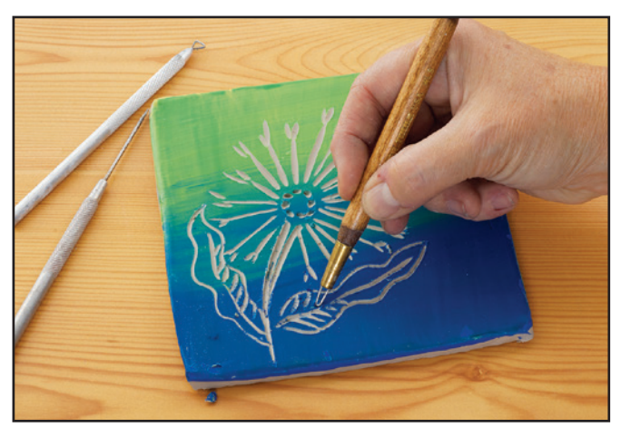
Step 3: Carve through the wax down to the clay beneath.