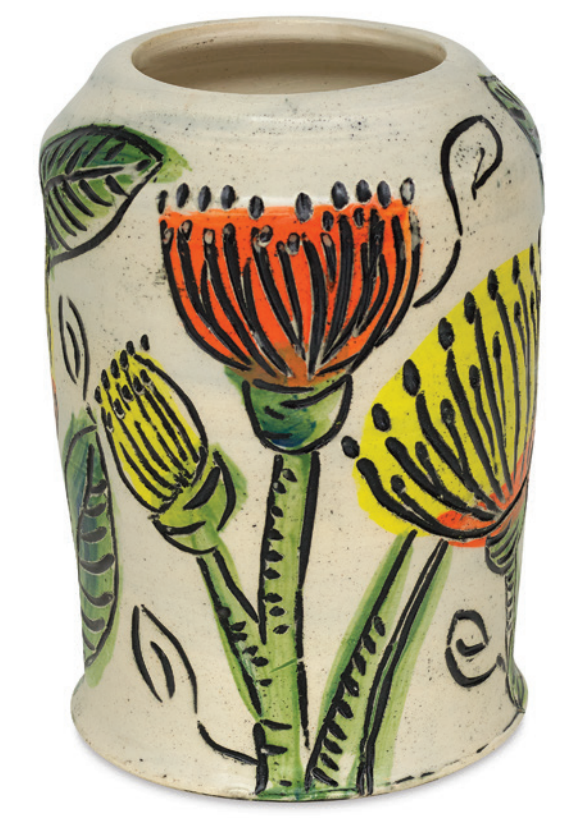
BLICK art materials