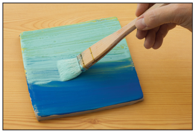
Step 2: Apply a layer of wax resist over colored areas. Allow to dry for one hour or overnight.