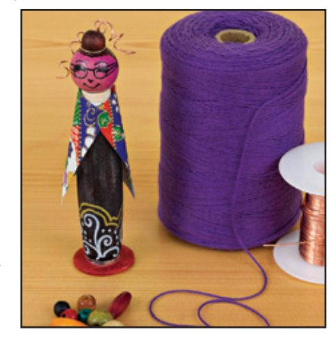
Step 3: Embellish with beads, ribbons, string, wire, and other materials.