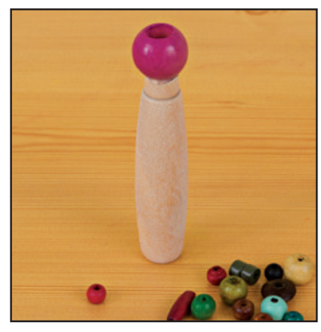
Step 1: Attach a wooden bead to a turned-wood shape to create a head and body.

Anchor Standard 11: Relate artistic ideas and works with societal, cultural, and historical context to deepen understanding.