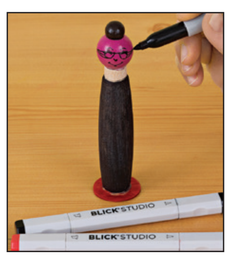
Step 2: Add features and clothing with markers, colored pencils, or paint.