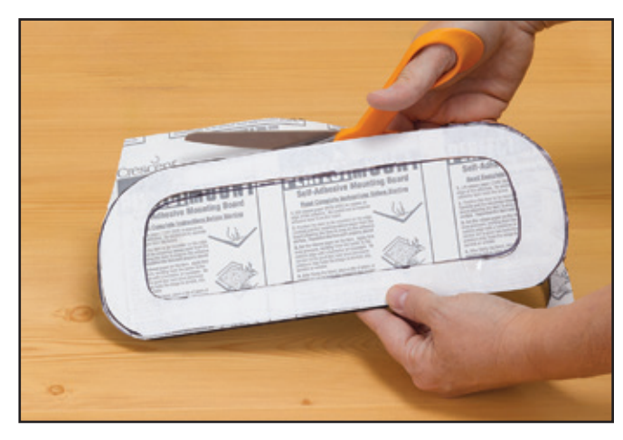
Step 1: Cut a rear-view mirror "frame" out of double thick adhesive mount board.

Synthesize and relate knowledge and personal experiences to make art.