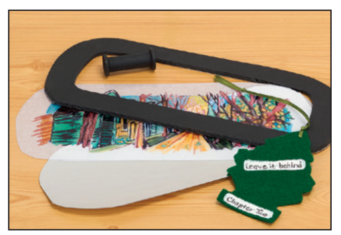
Step 3: Tape the mirror board behind the acetate and place both in the rear-view mirror. Glue a wooden spool to the back, and embellish with a "car freshener."