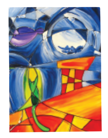
(E) Paint the clouds

Allow to dry for 24 hours, then bake in an ordinary oven. Place the glass directly on the center rack in a cold oven. Once the temperature has reached 160°C (325°F), allow to bake for 40 minutes.