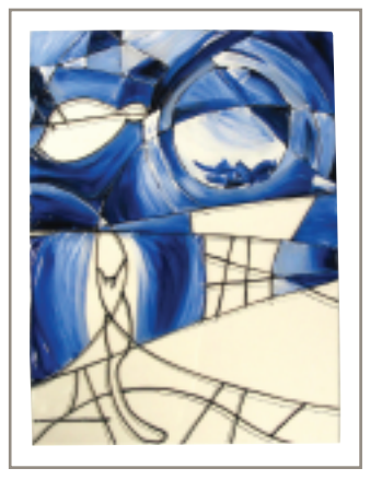
(B) Paint the sky area