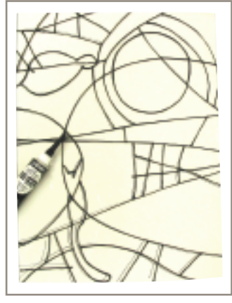
(A) Trace the pattern with the black outliner