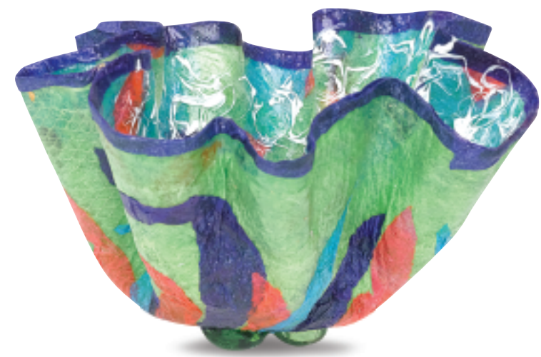
Gel-ly Bowl formed with Blick Tissue Paper collage, Golden Fluid Acrylic paint and glass globs for feet

- The Wireform can be cut in shapes other than circles, then bent to form almost any design, see example, at right.