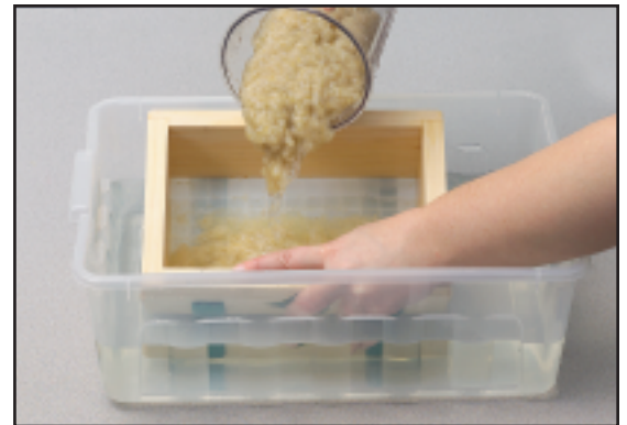
(A) Spread the pulp evenly in the mold