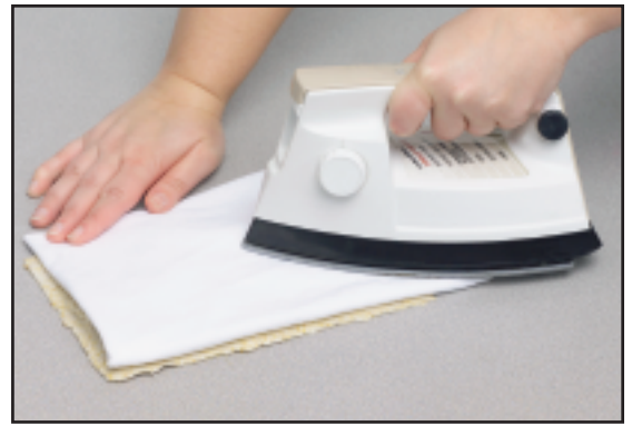
(D) Cover with a clean sheet of paper and press with a medium iron