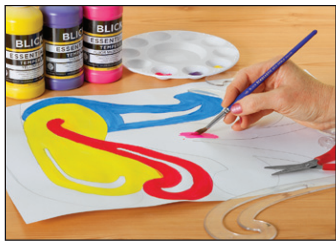
Step 1: Trace the outline of French curves or create free-form shapes on tag board, then paint with tempera on both sides.