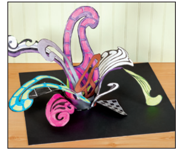
Step 3: Assemble the sculpture, attaching shapes to the inside and outside of the can. Arrange and rearrange to discover the effects of composition.