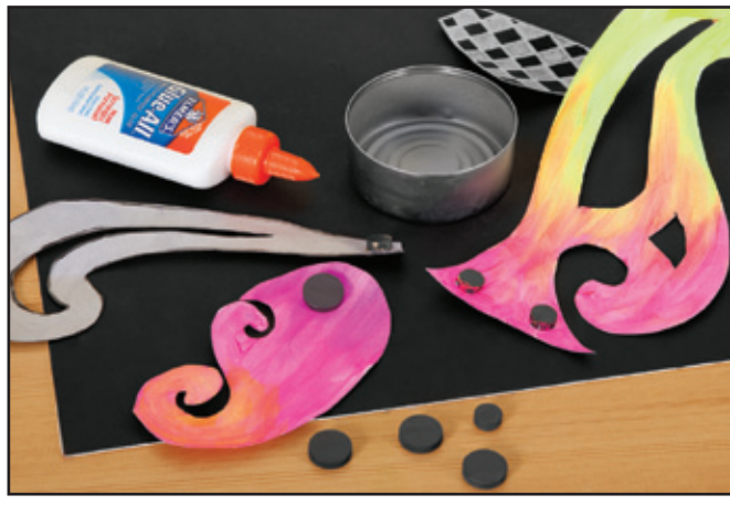
Step 2: Glue a metal can to the matboard and the magnets to the bottoms of the sculpture components.