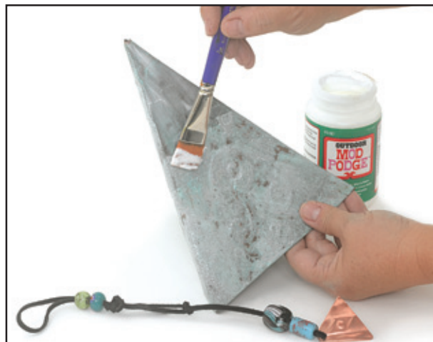
Step 3: Brush Mod Podge over patina, and allow to dry. Fold three sides in toward each other along edges, and glue. String loop, beads, and clapper onto suede lace. Hang!