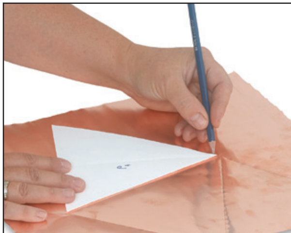
Step 1: Trace isosceles triangle pattern onto copper sheet. Repeat, positioning adjacent sides together, three times. Cut out and emboss sides of bell with embossing tools.

— Make a small pair of copper pendants or ornaments.