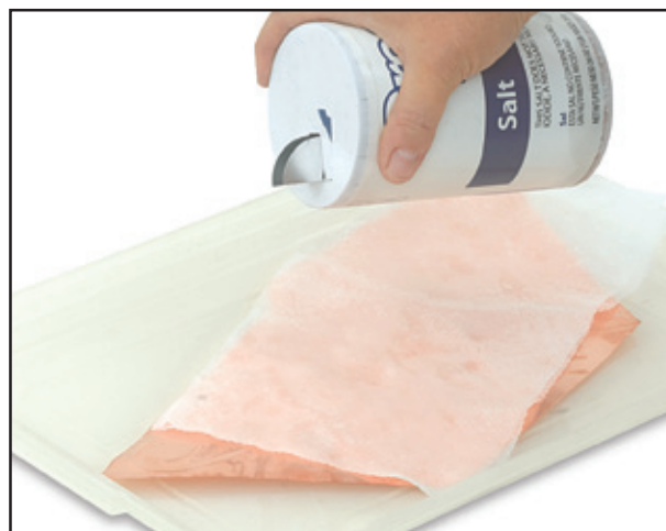
Step 2: Lay vinegar-soaked paper towel over copper sheet. Sprinkle liberally with salt. Let set overnight. Allow to dry.