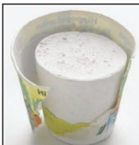
Once plaster is dry, tear away cup and removed modeling clay