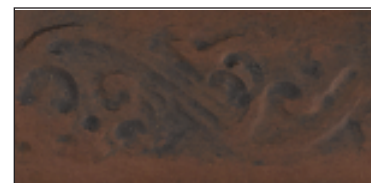
Close-up view of "antique" texture, created with black acrylic paint on brown leather

further definition to the texture with a glaze of acrylic paint. Use black paint on the brown leather and a gray mixture of 5 parts black to one part Titanium White on the black leather. To "antique", brush paint over the embossed pattern, then quickly wipe off the surface with a tissue. The paint will remain in the lower areas.