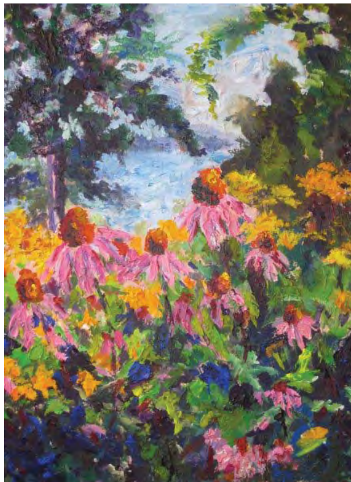
Coneflowers, Jennifer VonStein

Each of these mediums can be mixed directly to Interactive or applied directly to the surface for a variety of effects. Just remember that if you mix either of these mediums with Interactive, you will not be able to reopen the paint layers. However, when you add these mediums to Interactive, you will create a mixture that is more impasto and will take longer to become touch-dry. This will allow you more time to explore.